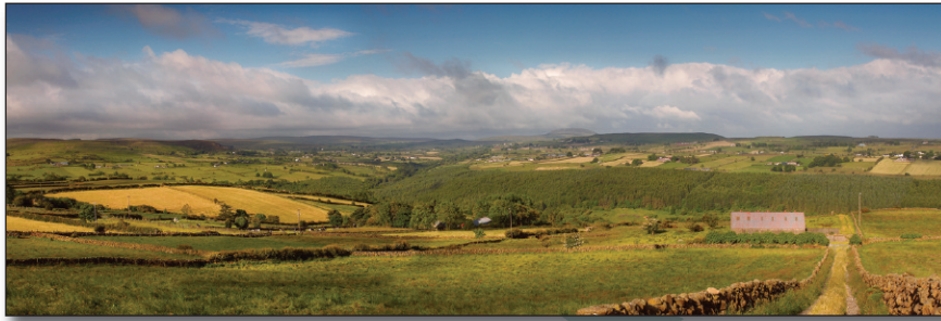
Early morning light over Glenarm Glen, with Slemish mountain just about visible in the distance.