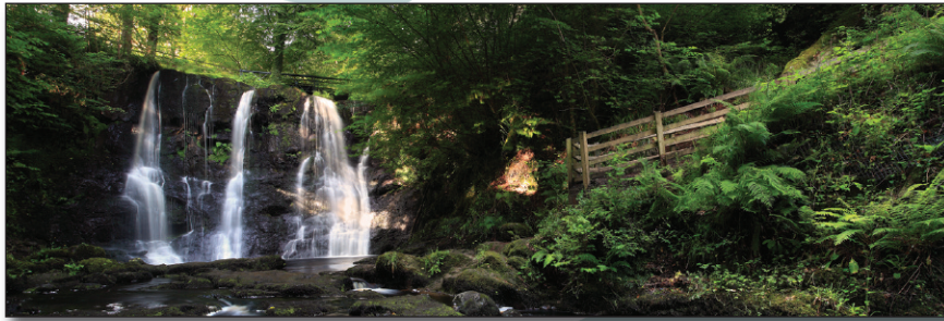
Ess-na-Crub Waterfall, Glenariff Forest Park.