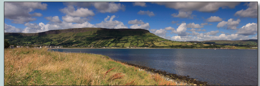
The magnificent Lurigethan and Glenariff Glen.