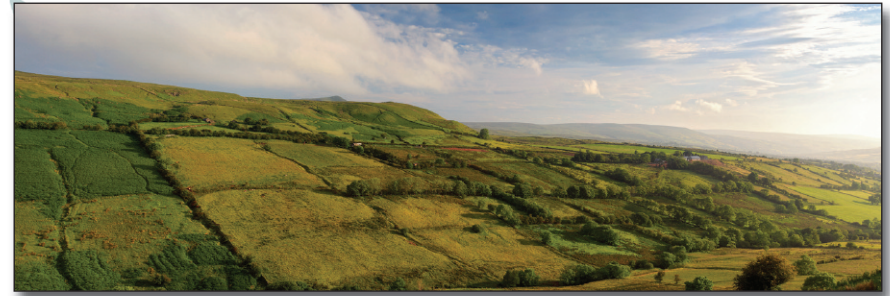
Looking down Glenballyemon towards Gaults Road.