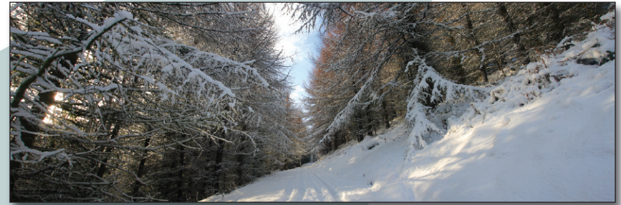
Deep snow in Glenariff Forest.